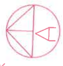
PLAN FOR BOREHOLE LOCKING BAR

40mm diam x 10mm THICK FLAT PIECE WELDED TO 25mm ROUND BAR